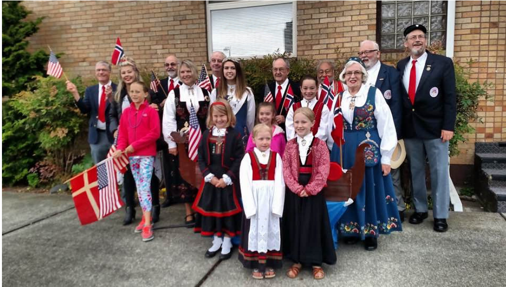
Representing Normanna in the Everett 4th of July Parade